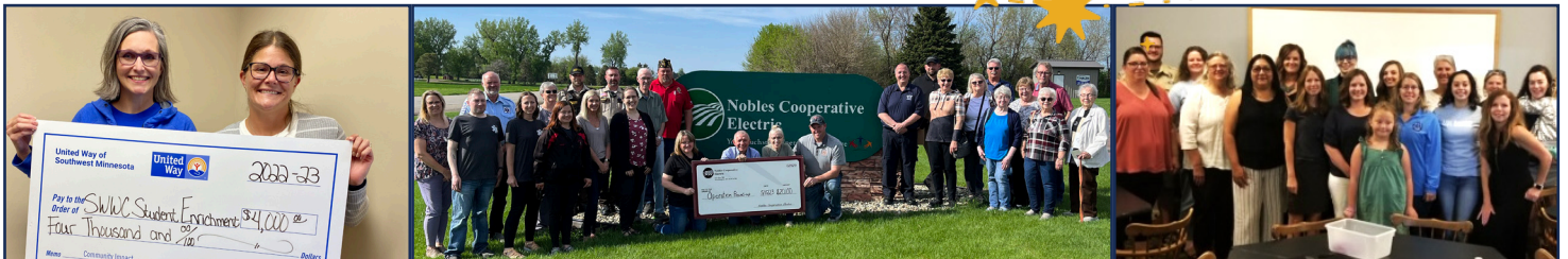
Pictured L-R: United Way of Southwest Minnesota, Nobles Murray Rural Electric Trust and United Way of McLeod County check presentations.